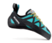
VAPOR LACE WMN