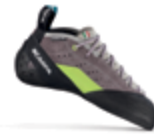
MAESTRO MID ECO WMN NEW