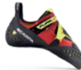
FURIA S NEW