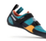
FORCE V WMN