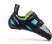
VAPOR V WMN