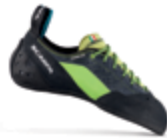
MAESTRO ECO NEW