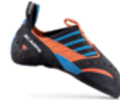
INSTINCT SR NEW