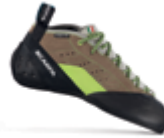
MAESTRO MID ECO NEW