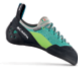
MAESTRO ECO WMN NEW